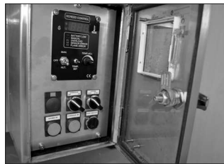
Automatic temperature control