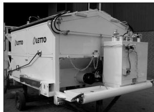
Bonding Agent tank 100/200L