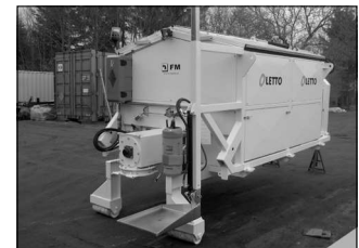
10L Bituslip sprayer