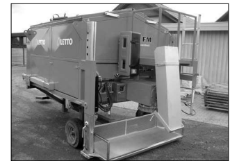
Platform for vibrator